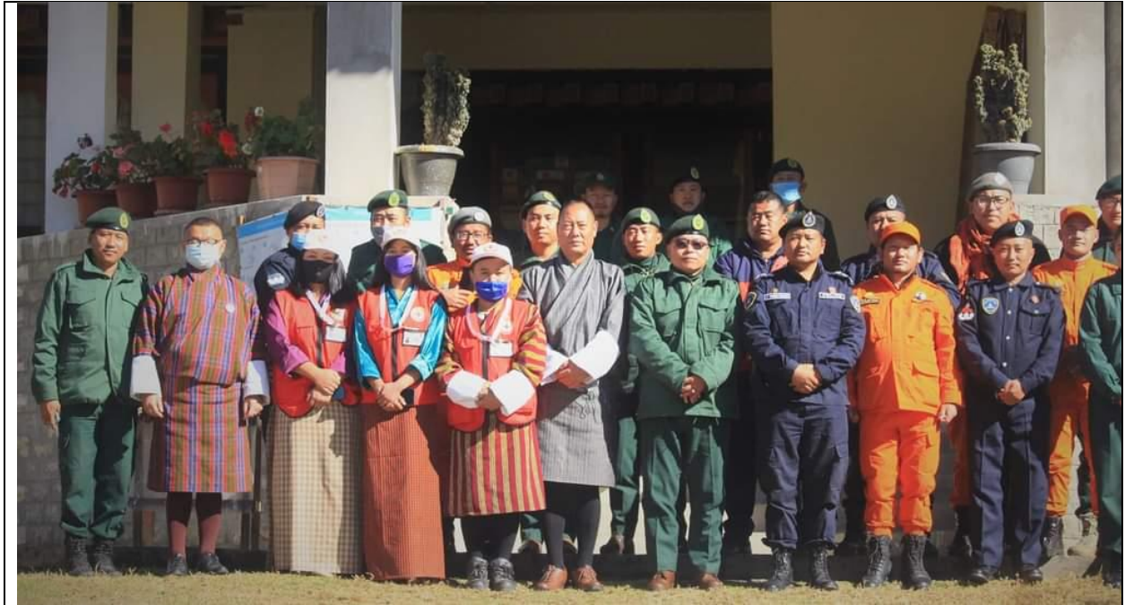
Inter-agency Forest Fire Coordinating Group 2021