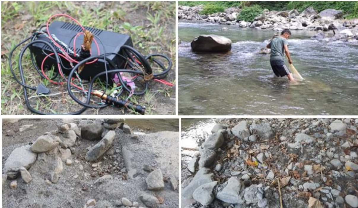
Figure 2- Pictorial evidences of threats pose on Golden Mahseer by illegal fishing

fishermen since it is easy to use with assumptions to catch more fish in a short duration of time. This method has detrimental effect not only to fish but entire aquatic ecosystem.